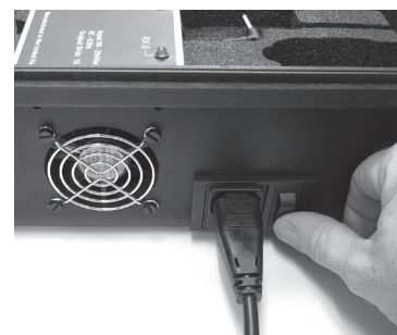
Figure 3: ON/OFF switch in the ON position